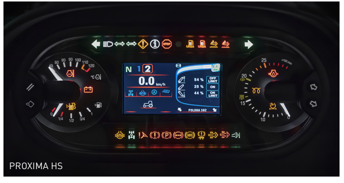
The dashboard with color display improves clarity and awareness of information given to the driver. All important data are placed in one place.