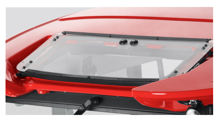
The roof window ensures good visibility during the work with a front loader.